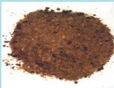
Granulated Slag sample