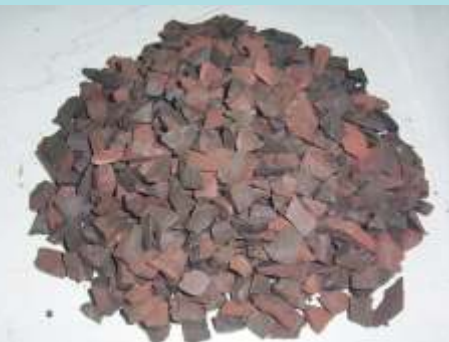
Crushed light weight sintered aggregate