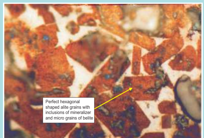
Optical Micrograph of mineralized OPC clinker fired at 1400°C (50x)