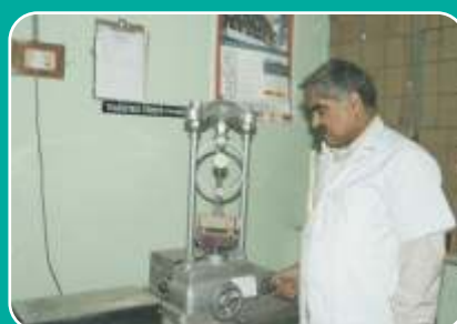
Transverse Strength Testing Machine