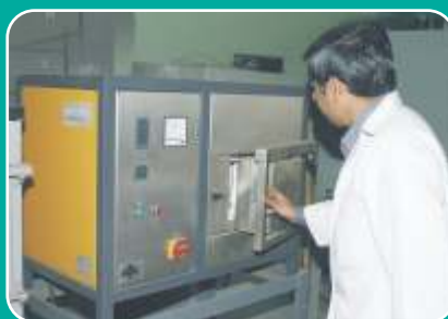
Heating Temperature Furnace