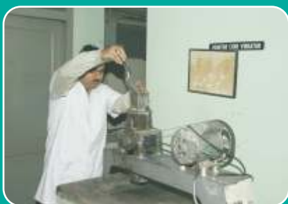
Mortar Cube Vibrator