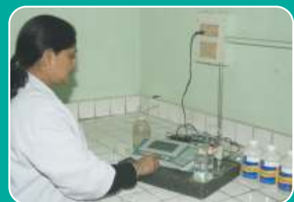
PH / ION Meter