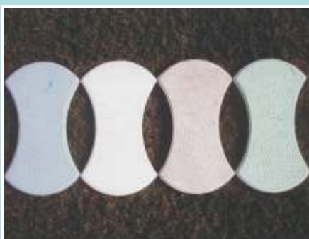
Marble based flooring tiles