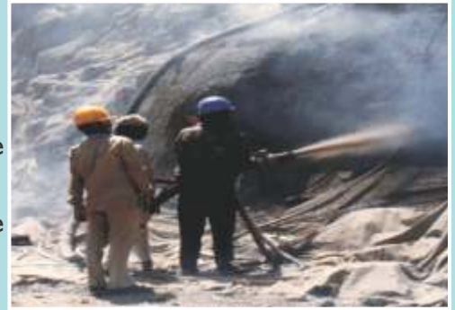
Shotcreting of NCB-Quick set formulation inside tunnel at a dam site