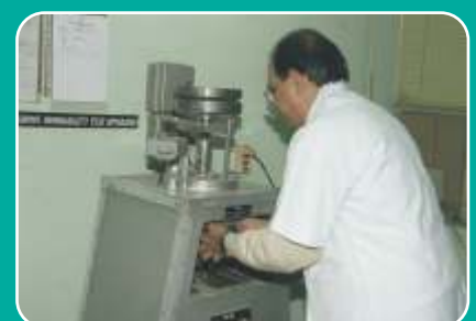
Hardgrove Grindability Test Apparatus