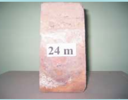
Brick sample from cement kiln at 24m indicated heavy discoloration due to infiltration of gases