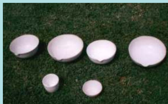
Ceramic pottery-ware utilizing refinery waste