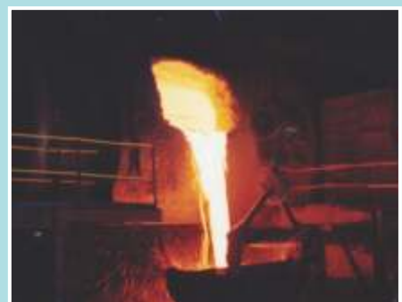
Copper slag generation