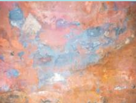
Corroded rotary kiln shell