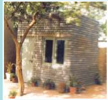
Fly ash bricks in construction