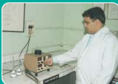
Flame Photo Meter