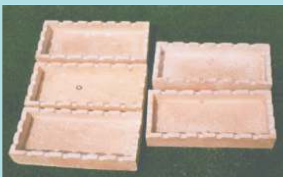
Refractory kiln furniture utilizing spent catalyst from refinery